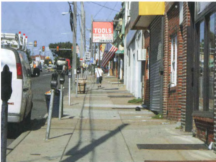
An existing West Chester Pike streetscape in Upper Darby.