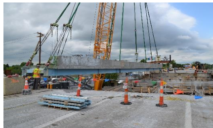
Precast steel beam / concrete deck sections constructed off-site