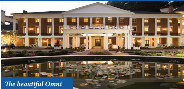
The beautiful Omni Bedford Springs Hotel