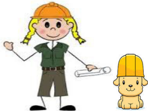
Penny & Dottie

Where in District 9-0 are Penny and Dottie?